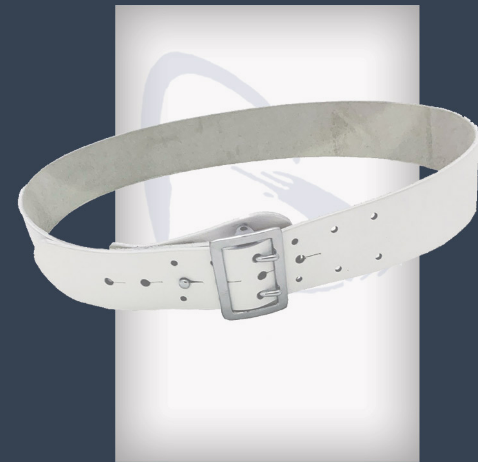
White leather belt