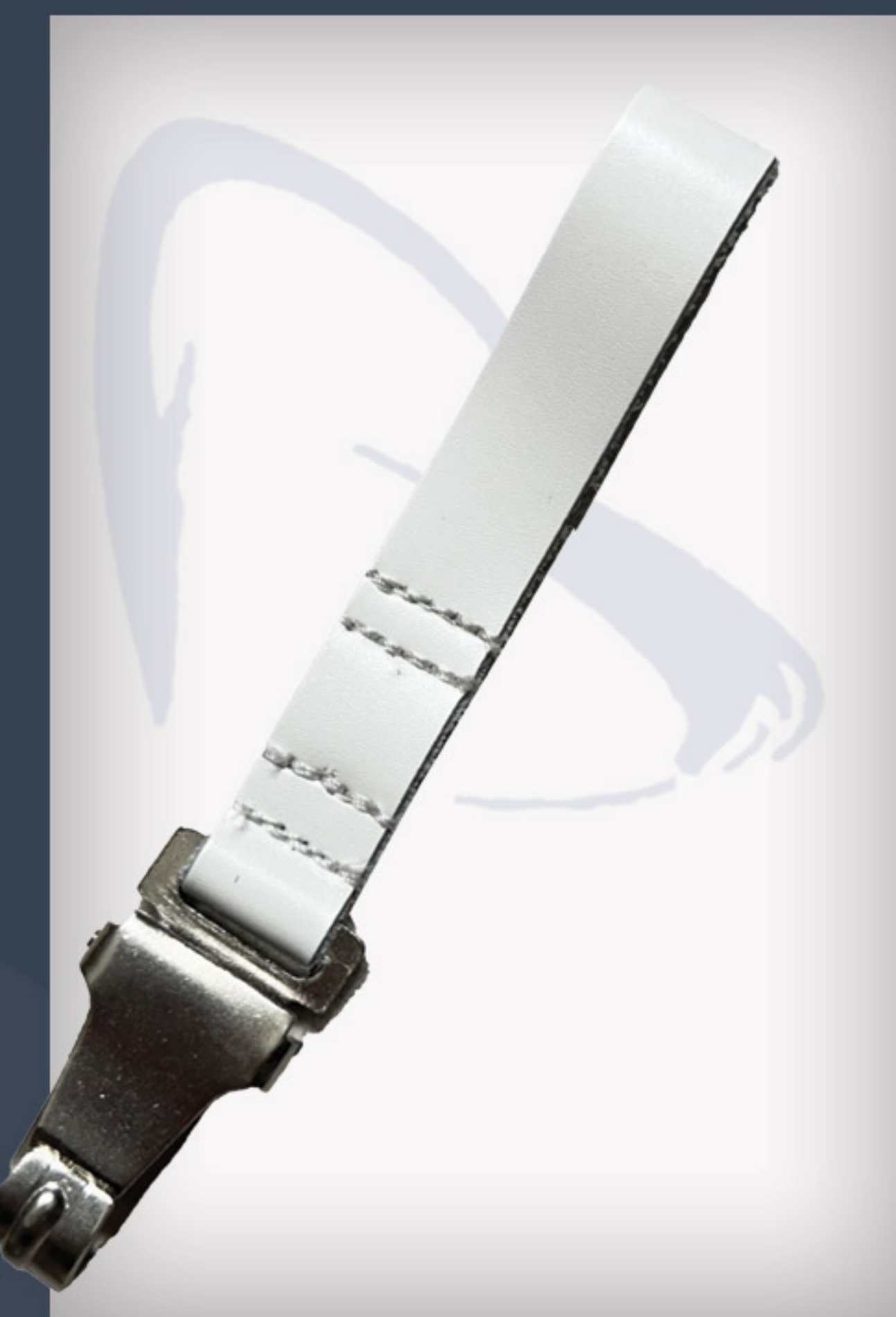
white leather sling