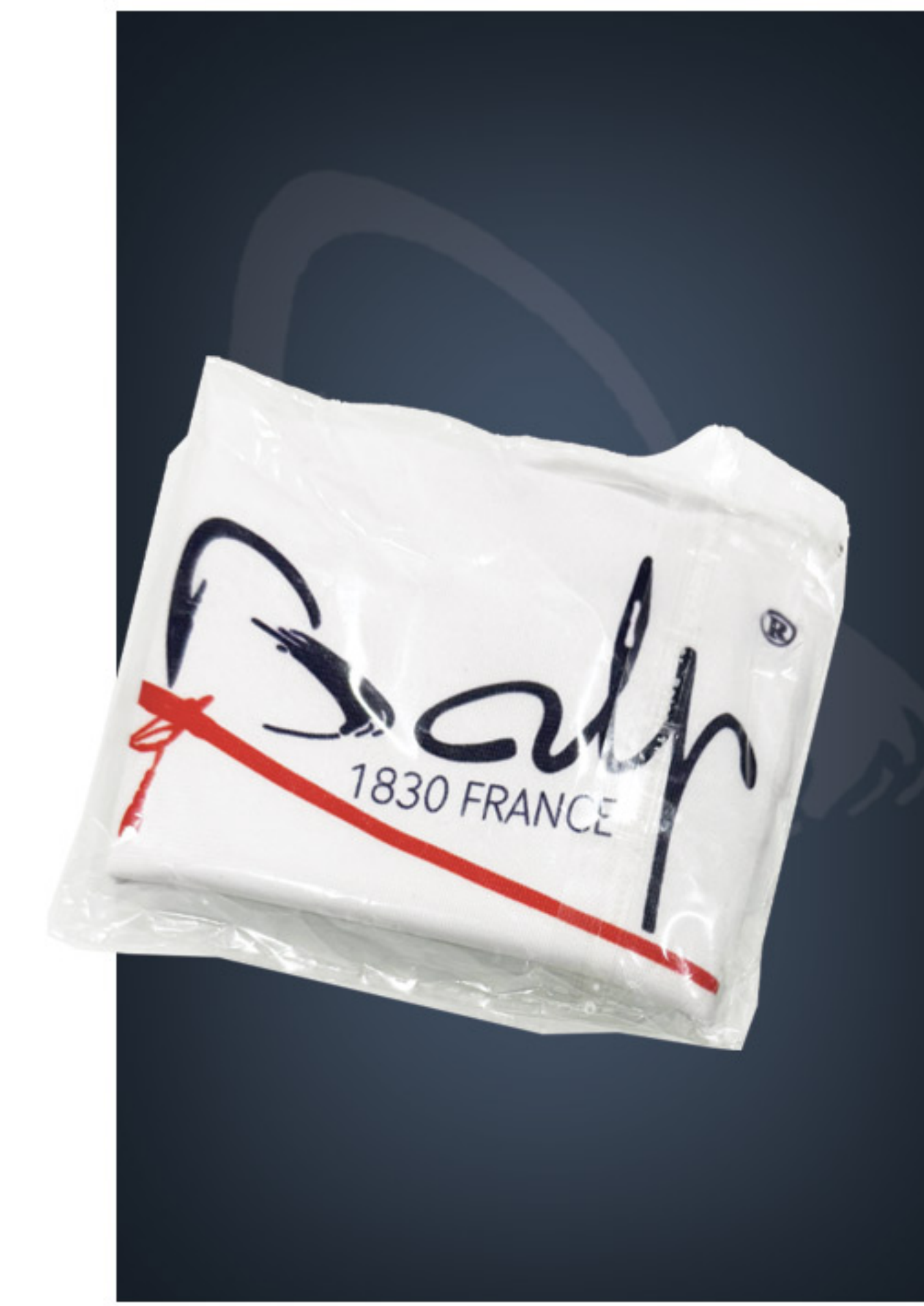
Cleaning cloth for sword