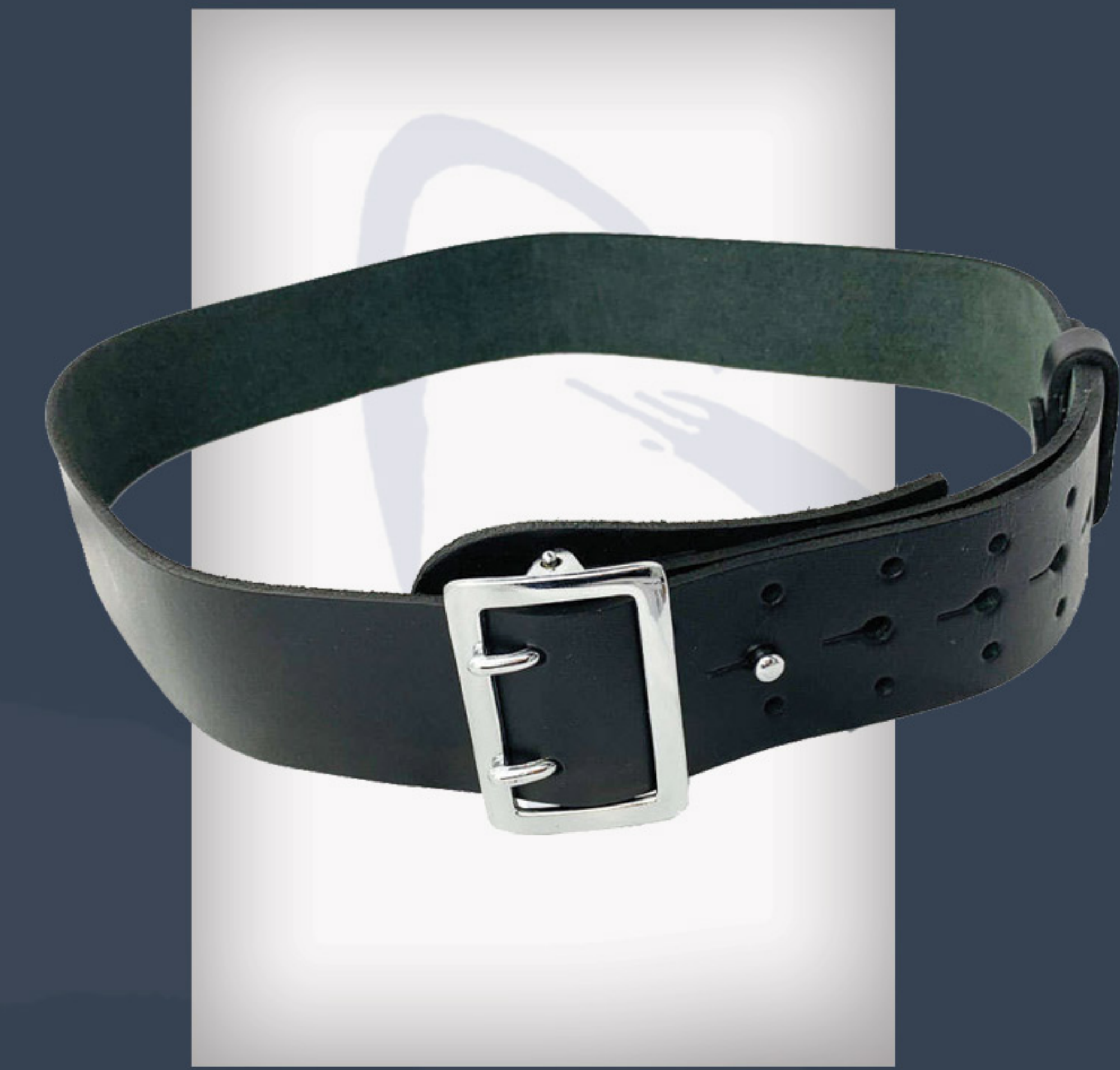
Black leather belt