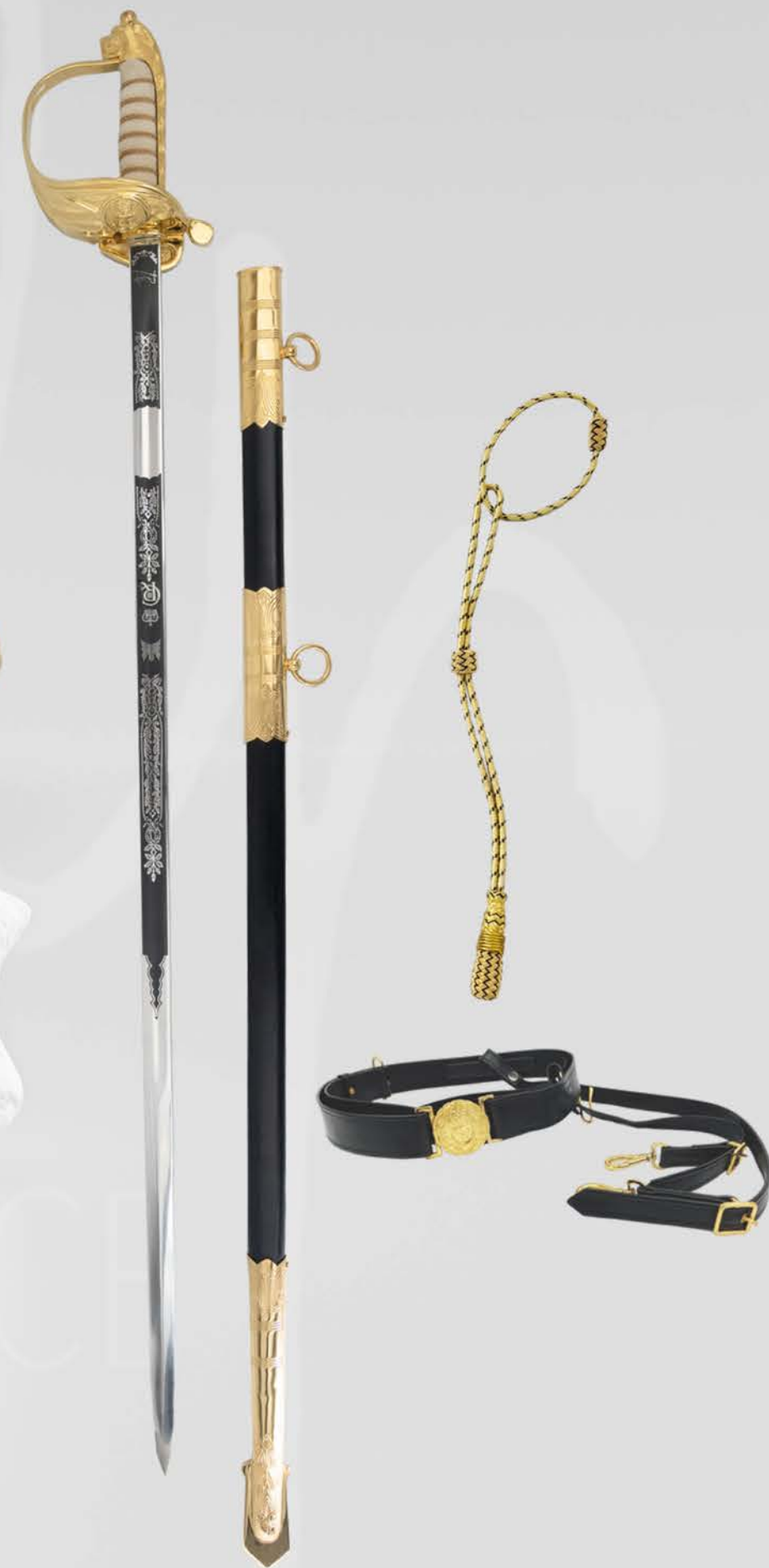
ROYAL NAVY SWORD