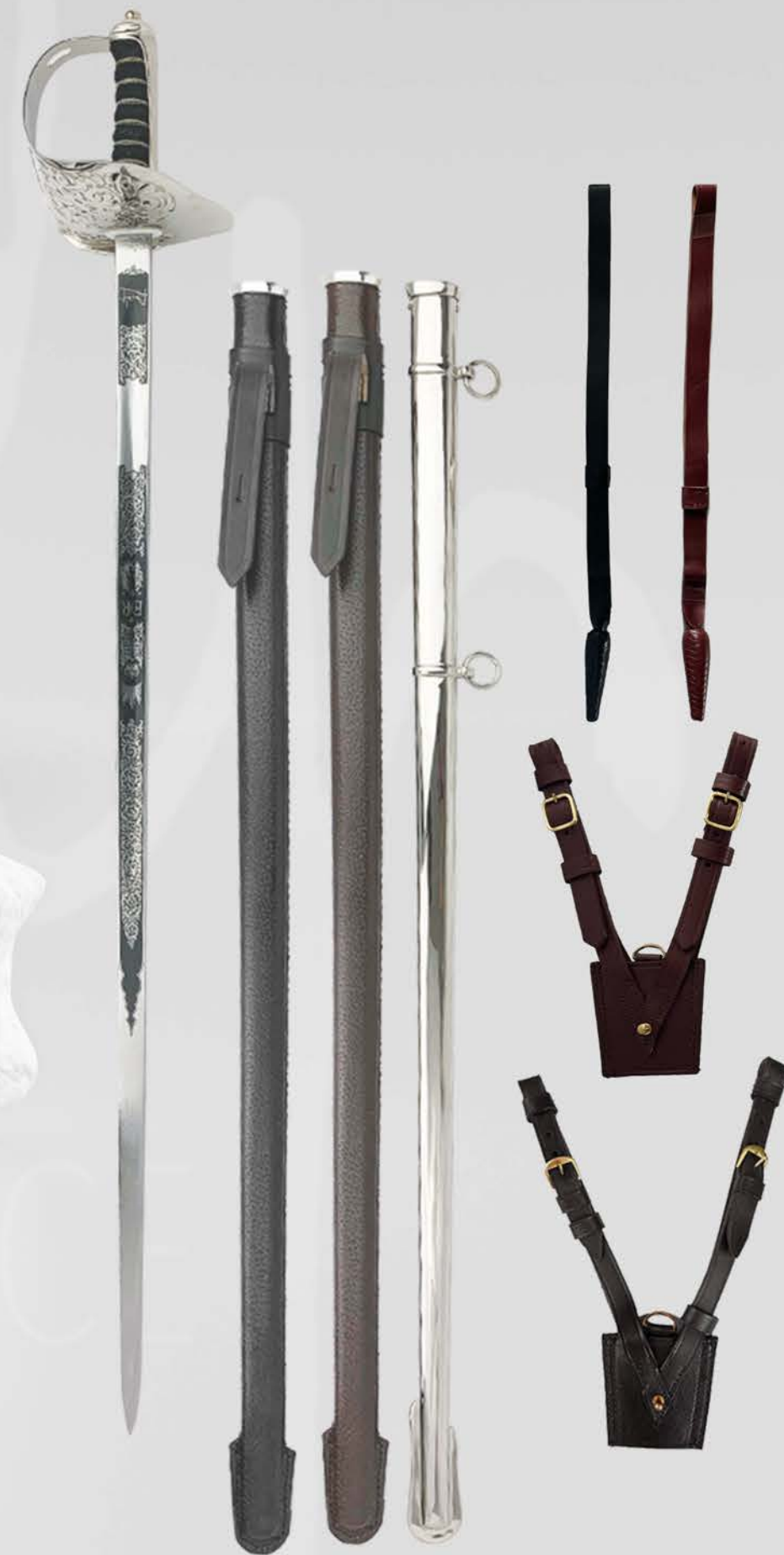
INFANTRY 1897 PATTERN SWORD