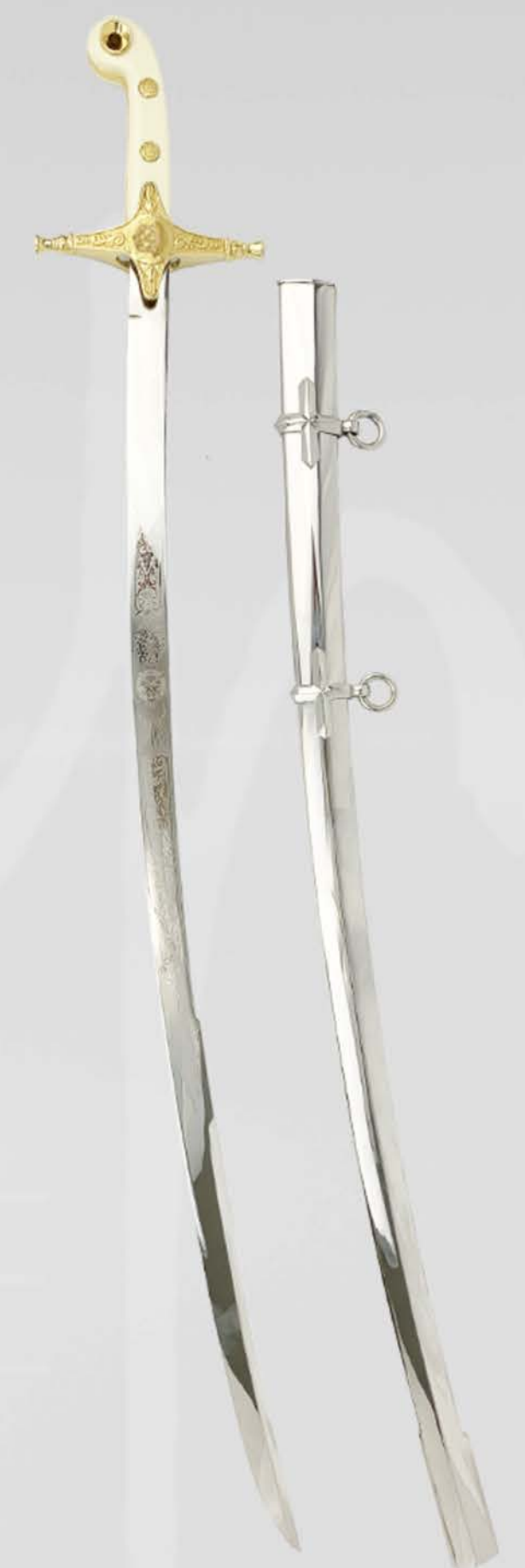
GENERAL SCIMITAR SABER