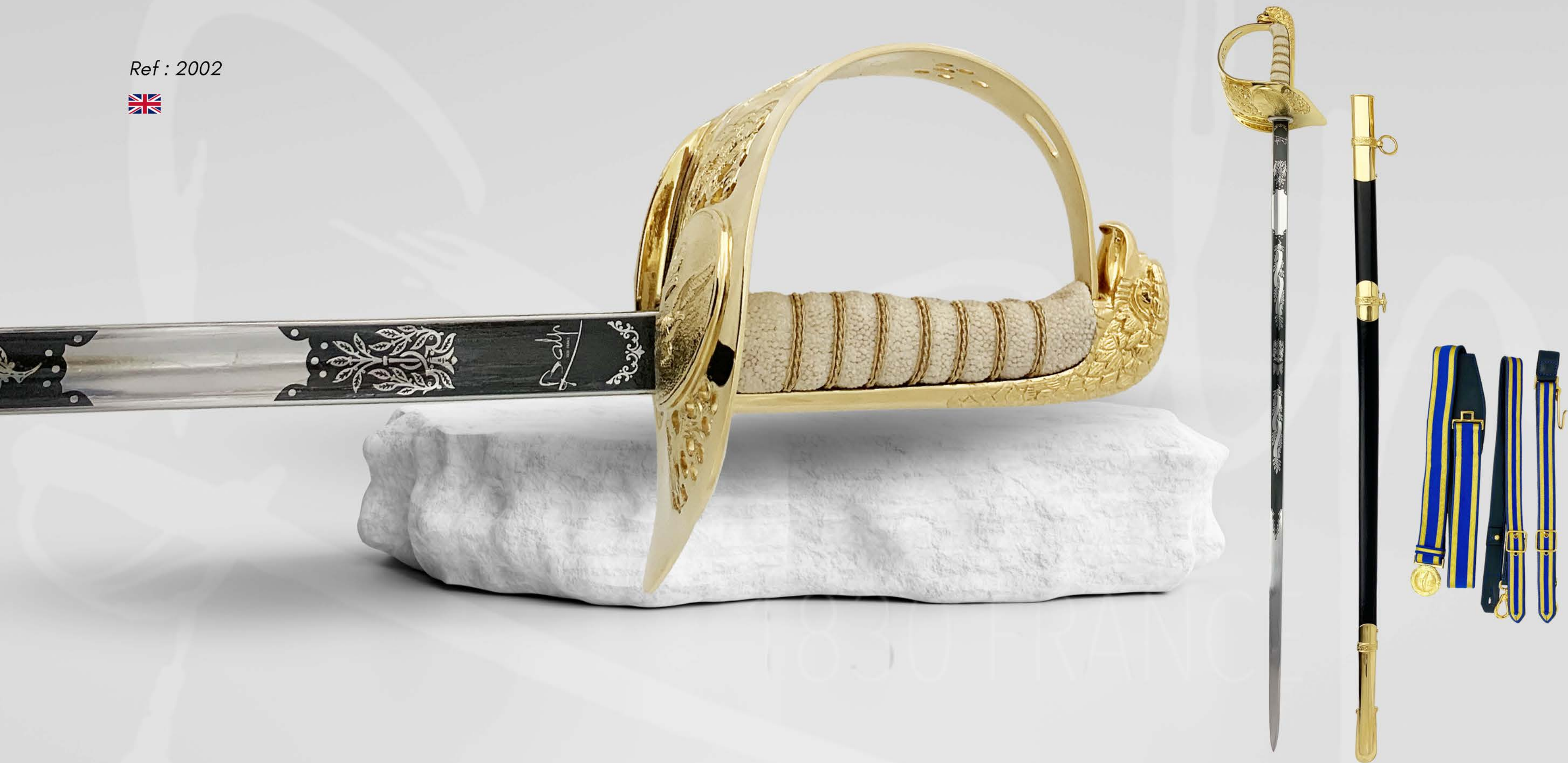
ROYAL AIR FORCE SWORD