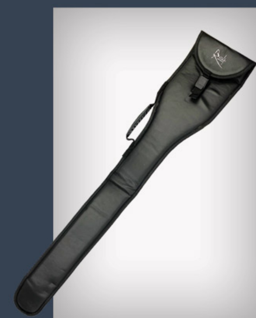
Carrying sword bag